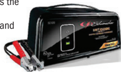
Schumacher 6A 6/12V Charger/Maintainer (SE-82-6-CA Replacement) CBC SC1320