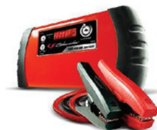
Schumacher 1000 Peak Amp Lithium Ion Jump Starter/ Portable Power (SL1 Replacement) CBC SL1316