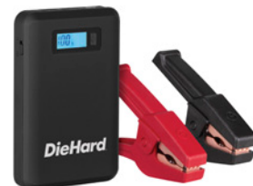
DieHard 800 Peak Amp Lithium Jump Starter & Power Pack: Safe Smart Cable and Clamps CBC DH0169