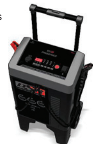
Schumacher 6/12/24V 330A ProSeries Battery Charger/Engine Starter CBC DSR124