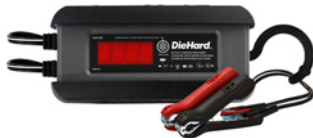
DieHard 3-Amp 6-Volt/12-Volt Automotive Battery Charger and Maintainer: Digital Display CBC DH0160