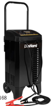
DieHard 200-Amp 12-Volt Manual Wheel Charger: 135 Minute Timer, Ammeter CBC DH0168