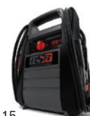
Schumacher ProSeries 12V/24V 4400 Peak Amp Jump Starter with USB and DC Power CBC DSR115

* Disclaimer: Not all products listed in this catalog are stocked in all stores or DC locations. If not stocked, they are available via special order.