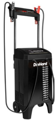
DieHard 300 Amp/200 Amp 12-Volt/6-Volt Automatic Wheel Charger: Digital Display CBC DH0164