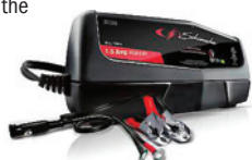
Schumacher 1.5A 6V/12V Fully Automatic Battery Maintainer CBC SC1343