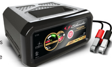
DieHard Fully Automatic Engine Starter Battery Charger: 55A, 6V/12V CBC SC1340