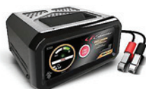
Schumacher 10A 12V Fully Automatic Battery Charger CBC SC1339