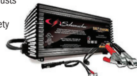
Schumacher 1.5A 6V/12V Fully Automatic Battery Maintainer CBC SC1355