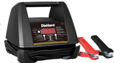
DieHard 125-Amp 6-Volt/12-Volt Battery Charger and Engine Starter: 40-Amp/15-Amp Boost CBC DH0163

* Disclaimer: Not all products listed in this catalog are stocked in all stores or DC locations. If not stocked, they are available via special order.