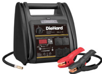
DieHard 6-in-1 Portable Power Station & Jump Starter: Air Compressor, Inverter CBC DH0167