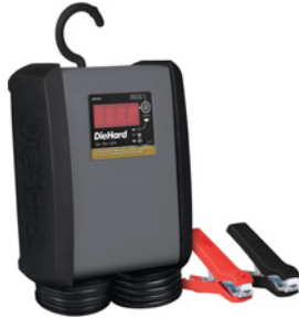
DieHard 15-Amp 6-Volt/12-Volt Automotive Battery Charger and Maintainer: Digital Display CBC DH0162