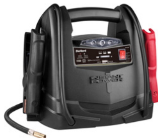
DieHard Four-in-one 1500-Amp Jump Starter and Portable Power Station: Air Compressor CBC DH0166