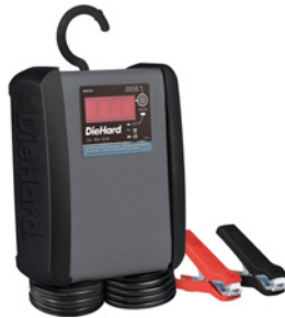
DieHard 10-Amp 6-Volt/12-Volt Automotive Battery Charger and Maintainer: Digital Display CBC DH0161