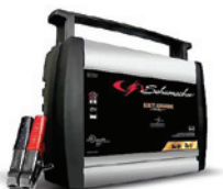
Schumacher 6A 6V/12V Fully Automatic Battery Charger CBC SC1357