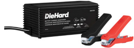
DieHard 2-Amp 6-Volt/12-Volt Automotive Battery Charger & Maintainer, Fully Automatic CBC DH0159