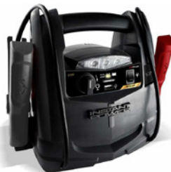
DieHard 800 Peak Amp Jump Starter + Portable Power CBC SJ1342