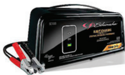
Schumacher 8A 6/12V Fully Automatic Battery Charger CBC SC1363