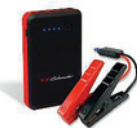
Schumacher 600A Lithium Jump Starter + Power Pack CBC SL1312