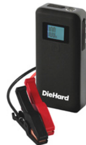
DieHard 1200 Peak Amp Lithium Jump Starter & Power Pack: Safe Smart Cable and Clamps CBC DH0165