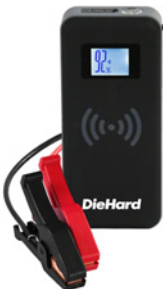
DieHard 2000 Peak Amp Lithium Jump Starter and Power Pack: Safe Smart Cable and Clamps CBC DH0170