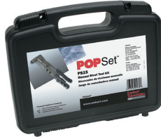
Heli-Coil POPSet® Manual Tool PS15-CS Professional Hand Plier Rivet Tool Kit HC PS15-KIT