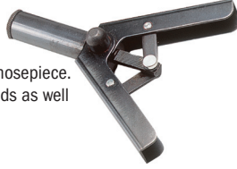
Heli-Coil Plastic Rivet Tool HC 60930